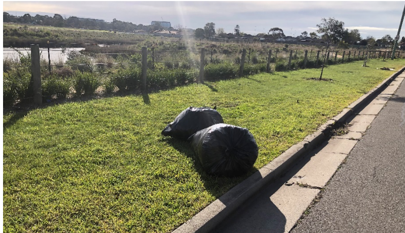
Fig 5: Rubbish Dumping along Gilmour Rd.

The rubbish dumped along the road, near the wetlands, not only diminishes the area aesthetically but also reduces the recreational value of the site. Some participants, such as P7, a 32-year-old female participant, indicated that stronger surveillance and the installation of CCV by the local government could help to address the problem: