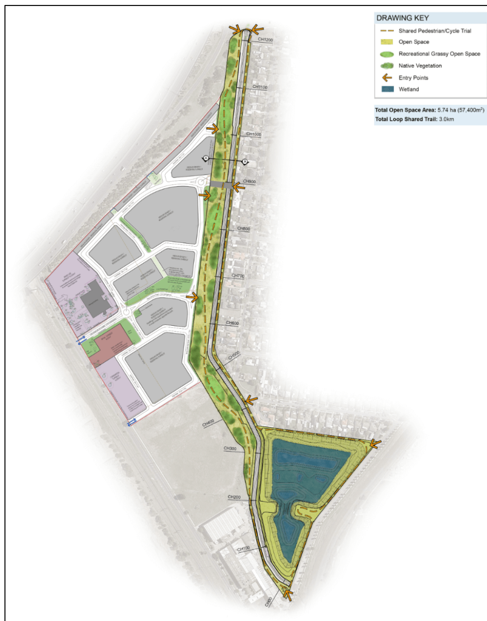
Figure 1: Concept design of creek revegetation

Prior to the commencement of the Upper Stony Creek transformation project (see Figure 1), multidisciplinary research (Phase 1) was conducted to understand the social and ecological dimensions of the site. Phase 1 research also provided baseline data for further research about the impact of the transformation on the health and wellbeing of residents, biodiversity, and people-nature interactions in the area over time. Through this study, 23 interviews were conducted during October 2016 to July 2017.