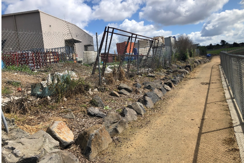
Fig 6: Southern side of the wetlands

even the external appearance of the factories—they're within their fence that grow mountains, mountains of dump rubbish within their fence, and it's not nice to look at or smell or see or hear. (P3, 32-year-old male)