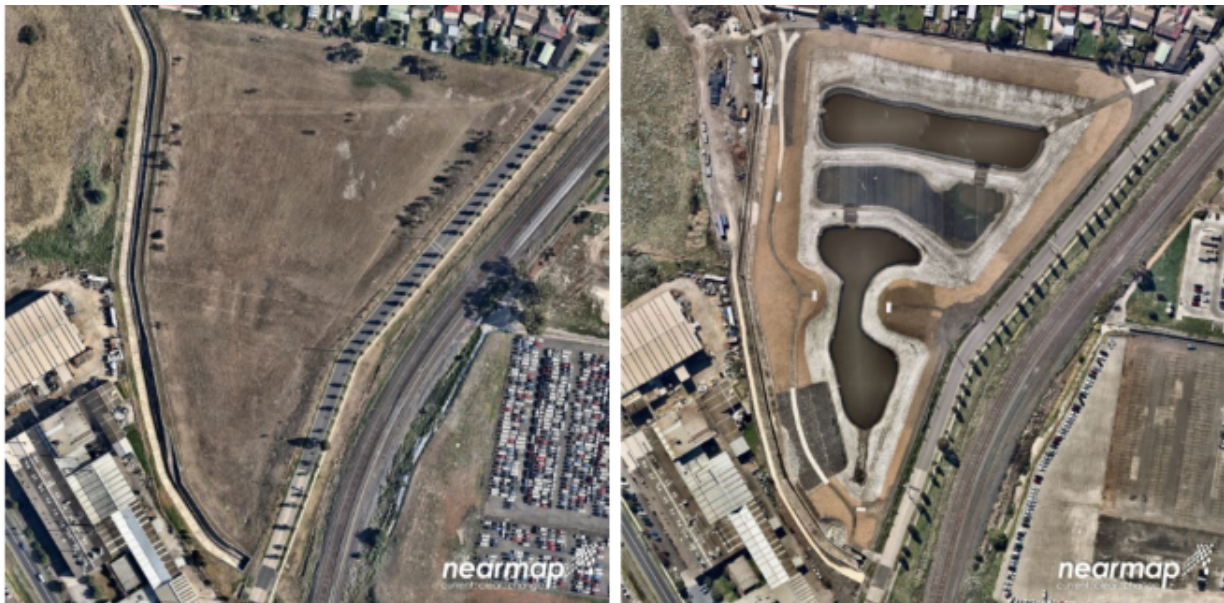
Figures 2 and 3: Upper Stony Creek wetland site, before and after – Nov 2017 to Sept 2020

The Upper Stony Creek transformation project did not progress as expected. In 2019, due to the discovery of large quantities of asbestos during excavation work, the focus of the project shifted from greening the site to cleaning up the asbestos. Accordingly, the focus of the project was redirected to a conversion of the wasteland along Gilmour Road into new wetlands and included the addition of a walking track along Upper Stony Creek. The reconfiguration of the project masterplan and the associated remediation works created significant delays that inhibited the post-evaluation phase within the initial research project scope.