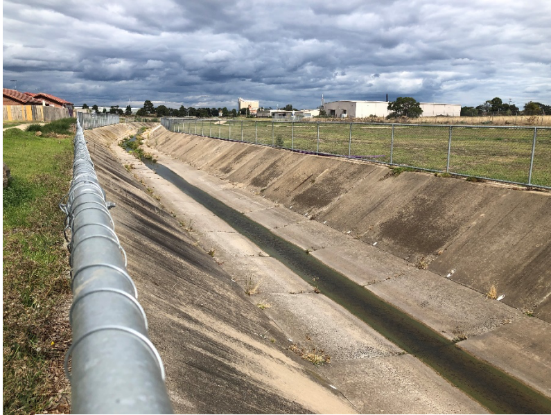
Figure 4: Upper Stony Creek concrete channel (April 2022).